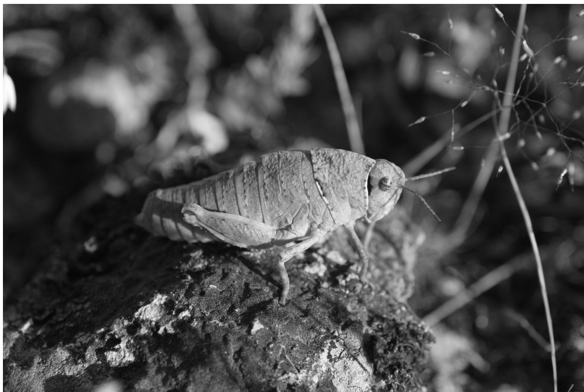
Fig. 1. Paranocarodes chopardi Pechev 1965, is an omnivorous orthopteran restricted to the oak-forested hills of the eastern Rhodopi mountains, between 200 and 900 m asl, met in open habitats dominated by thermophilous oaks with an undergrowth of Graminae and shrubs of Phyllirea and Erica . Until now, it has been recorded in a few localities within and to the west of the DNP and in one locality in SE Bulgaria.

ous omnivore, with a low dispersal ability that renders it prone to extinction if its habitat becomes degraded or fragmented (Samways 1997, Samways and Sergeev 1997). Its conservation status is Critically Endangered and as a priority species it ought to be listed in Annex II of the Habitat Directive (92/43/EEC) for conservation.